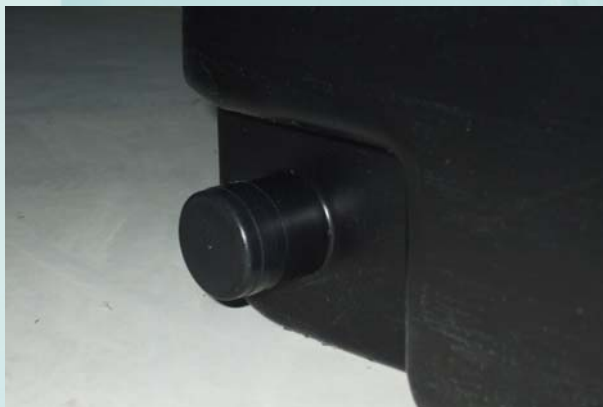
DN50 2" Connection Point.

The Garden Steel pump connects to the 3/4" brass threaded BSP outlet via the 3P Connector Kit