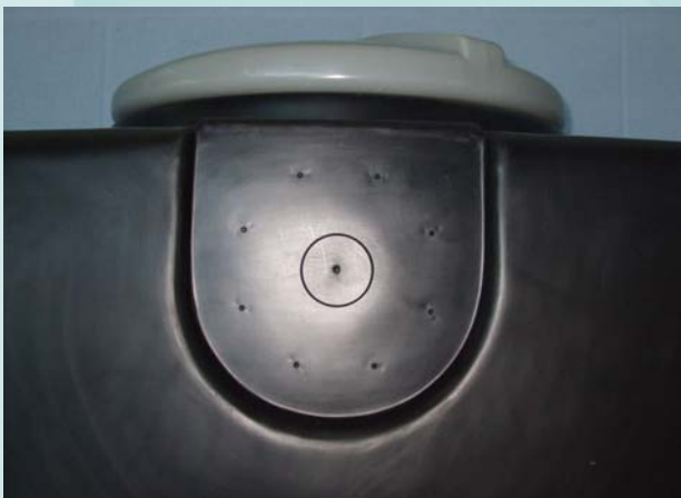
Marked Inlet Point and 460mm Lid

Art No. CEL1500BK - Utility Tank CEL1500BKRTS - Utility Tank System