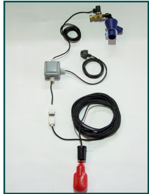
The 3P Rainwater Top-up Switch without Pump Control

A range of suitable stainless steel submersible pumps are available from your supplier. Pump bases for bottom mounted pump intakes are also available from stock.