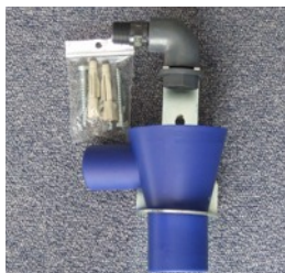
3P Tundish & bracket

Tundish: 5000411 Tundish with bracket: 5000410