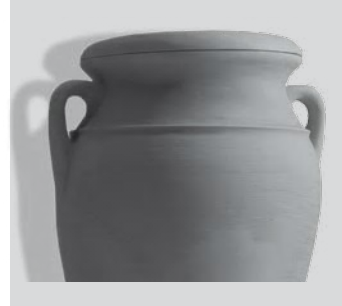
Using the screw provided, fasten the lid via the hole beneath the rim of the water butt.