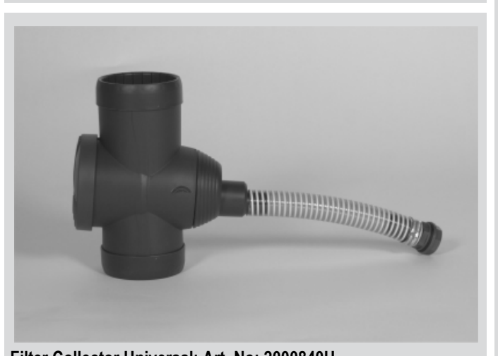
Filter Collector Universal: Art. No: 2000840U

This picture shows a 1" BSP thread - 32 mm hose tail in position (within a 32 mm drilled hole).